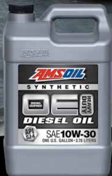
SYNTHETIC DIESEL OILS