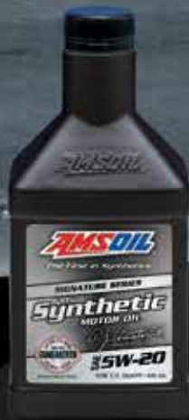
SYNTHETIC MOTOR OILS