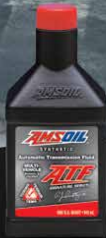
SYNTHETIC DRIVETRAIN FLUIDS